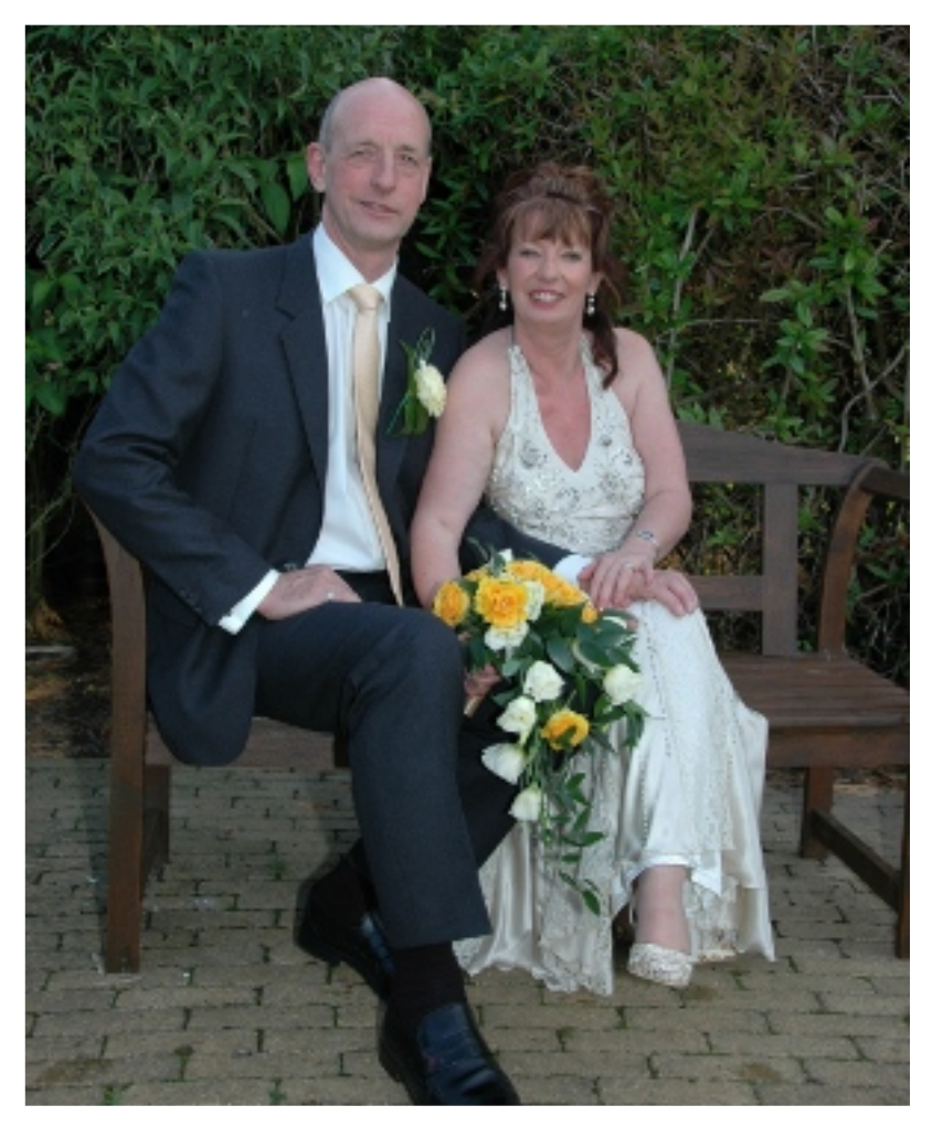
Tis done....we are brides!