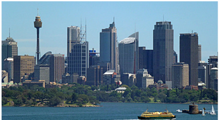
View of Sydney from North Head including Manly Ferry

Did you miss me? Did you even notice that I'd gone? Well... I'm back!